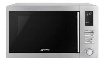
Smeg microwave with grill