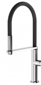
Phoenix Blix pull out spray mixer

40mm Deluxe Smartstone/Silestone benchtop