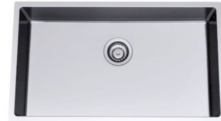
Clark Prism large single bowl stainless steel sink