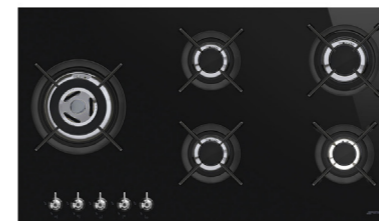
Smeg black glass cooktop