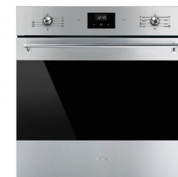
2 Smeg Pyrolytic wall ovens