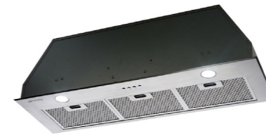
Smeg undermount rangehood