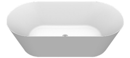
Forme Horizon freestanding bath