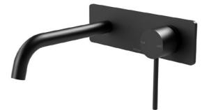
Phoenix Vivid wall basin mixer