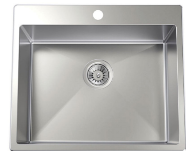
Clark 45L square drop in tub