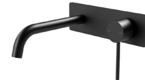
Phoenix Vivid 180mm bath spout and wall mixer