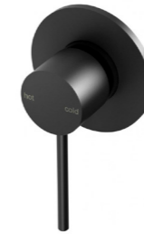
Phoenix Vivid shower and bath mixer