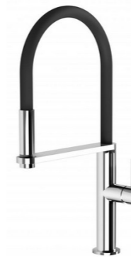
Phoenix Blix mixer tap with pull out spray