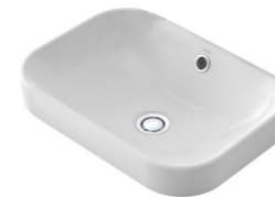
Caroma Luna inset basin