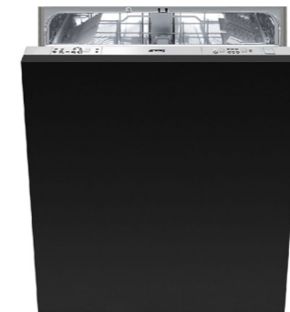
Smeg integrated dishwasher