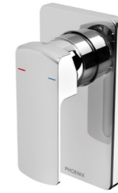
Phoenix Teva shower and bath mixer