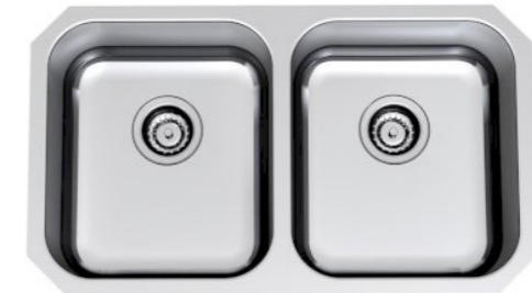
Clark Polar double bowl undermount stainless steel sink