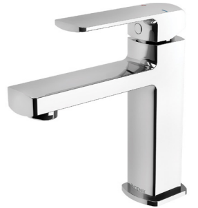
Phoenix Teva basin mixer