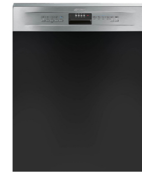
Smeg semi-integrated dishwasher