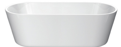
Forme Soul oval freestanding bath