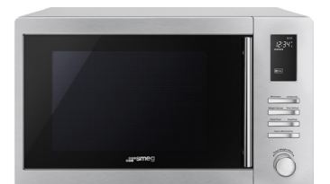
Smeg microwave trim kit included