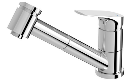
Phoenix Ivy mixer tap with pull out spray