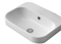
Caroma Luna inset basin