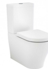
Luna wall faced toilet suite