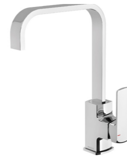
Phoenix Teva sink mixer