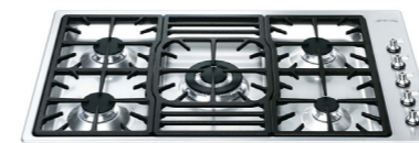
Smeg flushline cooktop