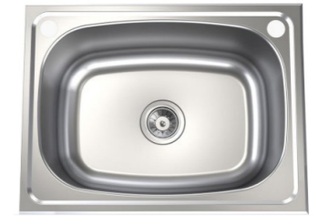
Clark 45L drop in tub