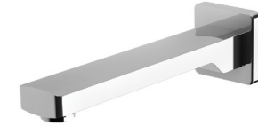
Phoenix Teva 200mm bath spout