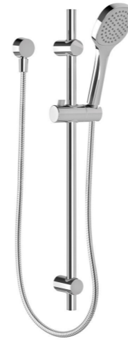
Phoenix Teva shower on rail