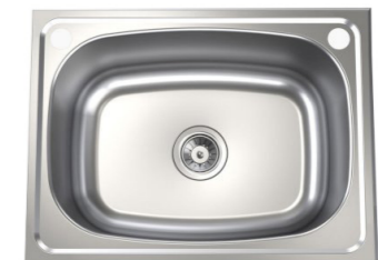
Clark 45L drop in tub