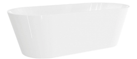
Forme Vancouver freestanding bath