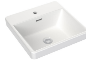
Clark square inset basin