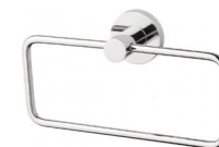
Phoenix Rarii hand towel holder