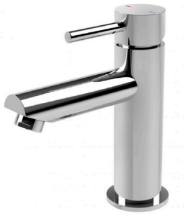
Phoenix Pina basin mixer