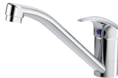
Caroma Acqua mixer tap