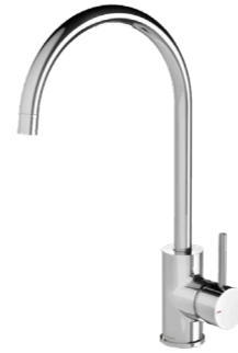
Phoenix Pina sink mixer

20mm Advantage range Smartstone benchtop