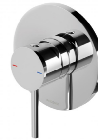
Phoenix Pina shower and bath mixer