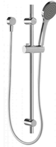
Phoenix Pina shower on rail