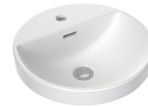
Clark round inset basin