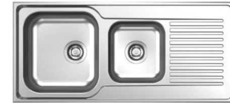
Clark Punch 1¾ bowl stainless steel sink