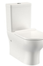
Clark round back to wall toilet suite