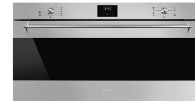
Smeg underbench oven