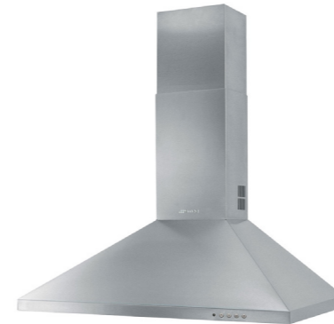
Smeg canopy rangehood