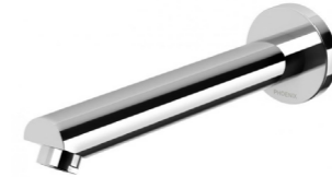
Phoenix Pina 180mm bath spout